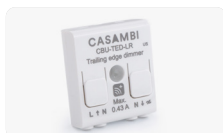
AL-CTLR-CBU-PWM4 OR AL-CTLR-CBU-TED-LR Casambi Controller *sold separately