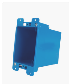
*Not Included with Purchase 1-Gang Electrical Switch & Outlet Box