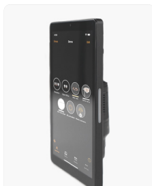
AL-CTLR-ADQ-RMT-8-HW Smart Home Control Panel